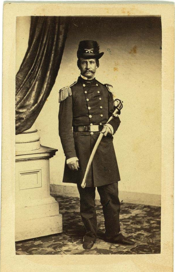
Figure 2 Officer David Hunter, full-length portrait in full military dress. Photographic print on carte de visite mount: albumen.

Upon entering the Valley, Hunter defeated the Confederates under General W. E. Jones at the Battle of Piedmont on June 5. He then moved on to Staunton where part of his army destroyed the warehouses and supplies stored there, along with the “steam mill, foundry, and carriage and woolens factories,” 13 while others began destroying the