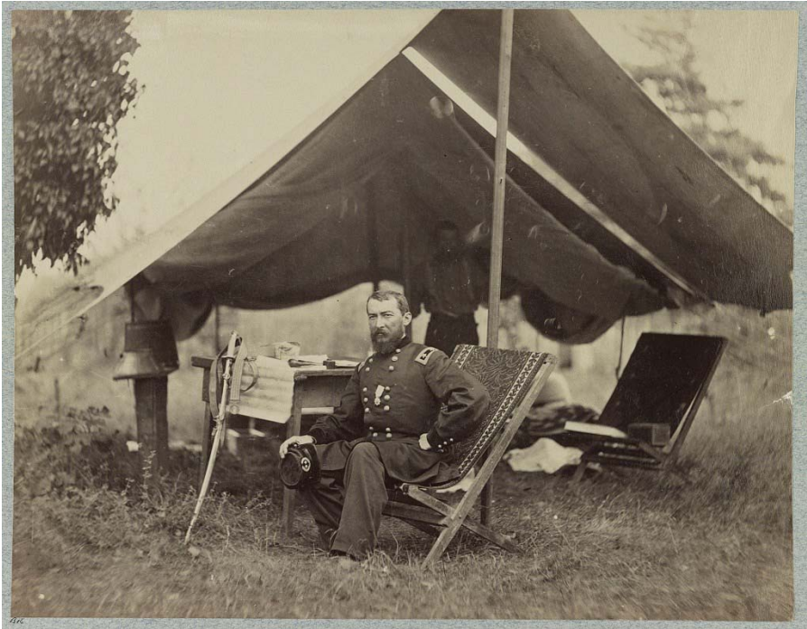
Figure 3 Major General P. H. Sheridan. Photographic print on card mount, albumen, photographed between 1861 and 1865.

While Sheridan was efficient in this position, he was “remembered as not being very pleasant.” 26 Sheridan had a confrontation with Brigadier General Samuel R. Curtis, who commanded in Southwest Missouri, over some horses that thieves had stolen from local farmers and were now trying to sell to the army to replace lost cavalry mounts. The issue arose when Sheridan refused a direct order from General Curtis to pay for the horses, and “responded with some hastily chosen words.” 27 Curtis had Sheridan placed under arrest for his refusal to obey a direct