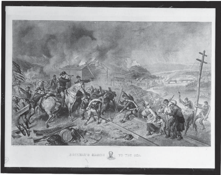
Figure 2 Sherman’s march to the sea . Lithograph print by Felix Octavius Carr Darley, c 1883.

war.” 15 To complicate matters, many buildings not targeted by Sherman for destruction after he captured Atlanta burned due to the fires at the military buildings. While Sherman’s actions in the destruction of Atlanta might be considered brutal and heartless, it was not necessarily a total war tactic, because