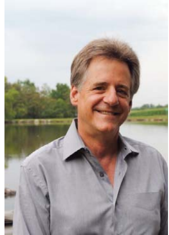
Figure 1 Photograph of author Jeff Shaara, used by permission.

The Fateful Lightning begins with the period after Union General William T. Sherman's occupation of Atlanta. Sherman's capture of the city ended the immediate political crisis by ensuring Lincoln's reelection. However, Sherman realized there was also a political and military crisis to be faced, particularly with his commander, General Ulysses S. Grant bogged down around Petersburg, Virginia. Sherman, with his knowledge of the South, understood that for the war to end, the level of Southerners' pain and suffering needed to be elevated. Shaara nicely allows us to see that Sherman's decision to march to the sea and to make Georgia howl was a decision of the highest strategic order; Sherman—as we see through the author's eye—wanted the war to be over but also knew he must become more brutal. The beauty of this new work is that a reader can appreciate it as a stand-alone volume.