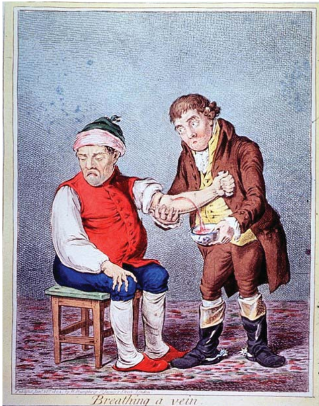
Figure 4. “Breathing a vein,” by James Gillray, published by Hannah Humphrey, hand-coloured etching, published 28 January 1804.

hospital. Generally, surgeons trained through an apprenticeship, as there were a limited number of medical schools and professionally trained instructors. 7 Therefore, care of wounded soldiers often widely varied from location to location, and knowledge or prevention of infection caused by unsterile medical practices was not common or regulated.