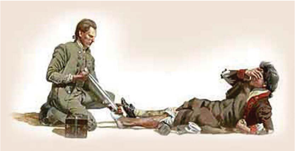
Figure 1. Revolutionary War wound care.

The Revolutionary War signals the beginning of true American history, the point at which we evolved from thirteen fledgling colonies maintaining a separate existence from one another under the watchful, restrictive eye of Great Britain into a collective force of American citizens, fighting together for independence, freedom, and autonomy. While every boy and girl learns about the American Revolution during grade school, and although aspects of the Revolutionary War permeate our daily culture from annual holidays to celebratory liquor labels, there is a lot left unexplored within the history of the Revolutionary War.