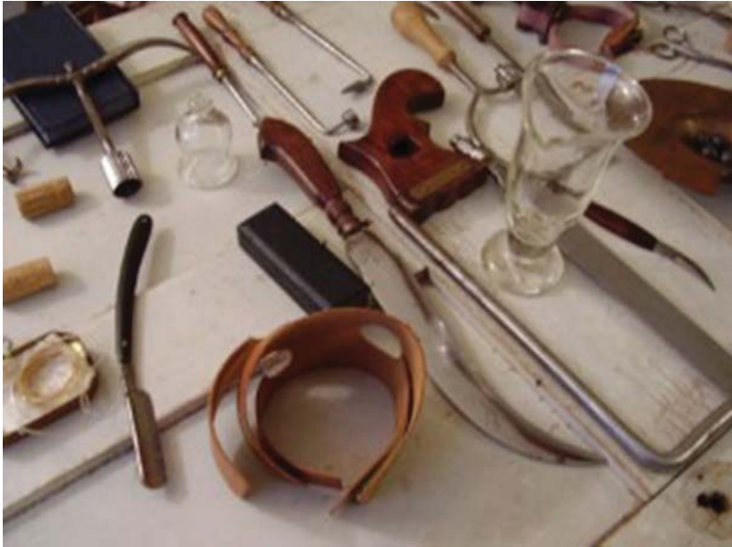
Figure 3. Revolutionary War medical doctor's instruments.

Generally, when a soldier is wounded in battle, there are different levels of severity in regards to the injury sustained. The treatment of injuries that did not result in loss of life would have differed both in the availability of treatment as well as the urgency of care received. The treatment varied depending on the type of wound as well. The most popular treatment for wound care during the Revolutionary War was the application of lint to the wound site. The use of lint was instrumental as a form of bandage to keep the wound from continuing to bleed, to absorb blood in the form of a type of compress, and also to ward off any further damage to the wound. 4 In fact, the use of lint became preferential over any other type of ointment or bandage due to the mild and healing effects of the soft lint against the tender injury. Opium was often a treatment to manage pain.