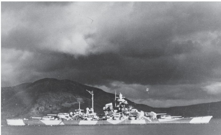
Figure 1. “ The Lone Queen of the North. ” Lurking in Norway’s picturesque fjords, Tirpitz posed a grave menace to the Allied Arctic convoys. This is how the ship appeared during Operation Rösselsprung; she is seen here in Altafjord sometime after the abortive sortie. ( http://www.history.navy.mil/our-collections/photography/numerical-list-of-images/nhhc-series/nh-series/NH-71000/NH-71390.html )

unglamorous, the policy of weaker naval powers throughout history has often been to further their strategic goals by keeping their fleets intact, avoiding risking them against the enemy unless absolutely necessary. The fleet-in-being strategy—a term coined around 1690 during the War of the League of Augsburg—is an appealing option for naval powers that have little to gain and much to lose by risking their few precious capital ships in tests of strength against superior enemy forces. By keeping its fleet “in-being,” a weaker naval power risks little while possibly gaining much—forcing the enemy to react in accordance with its wishes, to a greater extent than if its fleet was squandered in costly naval engagements. 4