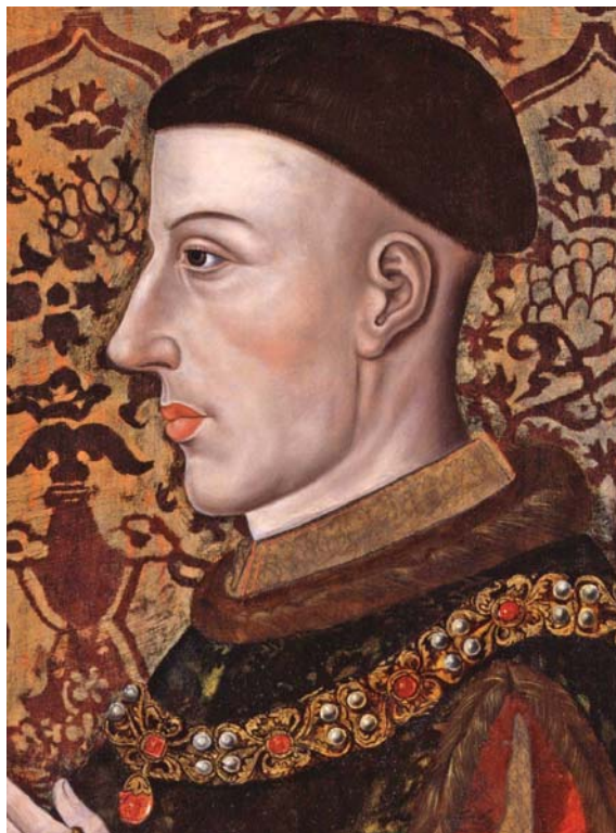
Figure 1. King Henry V, by unknown artist. Oil on panel, late sixteenth or early seventeenth century. National Portrait Gallery, UK.