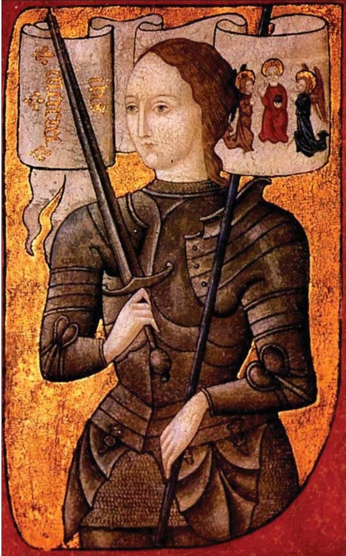
Figure 5. Joan of Arc , oil on parchment, c. 1450-1500. Miniature portrait in an illustrated manuscript. Centre Historique des Archives Nationales, Paris, France.

right to this Kingdom of France, the king of Heaven orders and notifies you