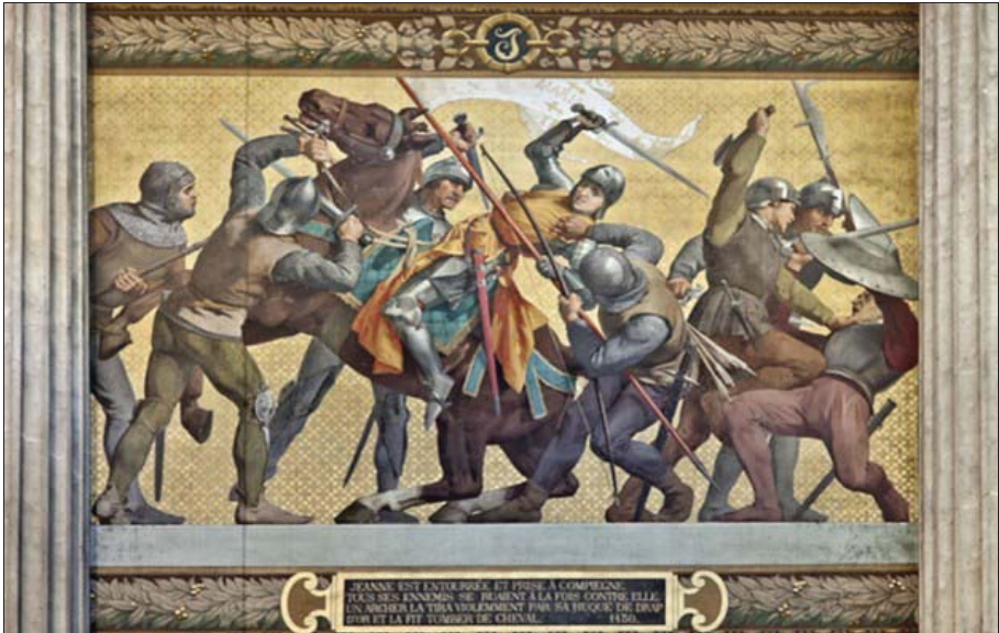
Figure 9. Joanne of Arc Falls Prisoner at Compiègne , by Jules Eugene Lenepveu, c. 1886-1890.

The seemingly unstoppable French advance caused the English to surrender the fortress, which resulted in a French victory that lifted the siege of Orléans. Nine days after Joan's arrival at Orléans, the siege had collapsed. This military victory was a major turning point in the Hundred Years' War. Afterwards, more fortresses fell within the duchy, causing the English to send forces to stop the advancement but they were in turn defeated. In just a few weeks, the English from the Loire valley were swept aside and Bedford, the English Regent of France, had lost much of his supplies, which greatly crippled any further English advance for the time being.