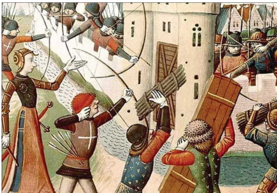
Figure 8. French troops of Joan of Arc besieging the English fortifications during the siege of Orléans, c. fifteenth century.

hold no longer in their earth-and-timber fortress, and after witnessing that Joan was not dead, fled the flimsy ill-constructed fort for the safer stone fortress of Les Tourelles. It was at this moment that Joan saw Glasdale fleeing and shouted to him. “Glasdale! Glasdale! Yield to the King of Heaven! You called me a whore, but I have great pity on your soul and the souls of your men!” 8 Whether Glasdale stopped or not is up for debate, but during the chaos around them, a French incendiary boat became wedged beneath the wooden drawbridge, causing it to catch fire. Glasdale and his men attempting to cross it to reach the safety of Les Tourelles, did not make it, for the bridge caught fire and soon weakened. The bridge could not hold the weight of the men and it disintegrated and gave way. Glasdale, and the men with him, crashed into the river and drowned due to the weight of their armor.