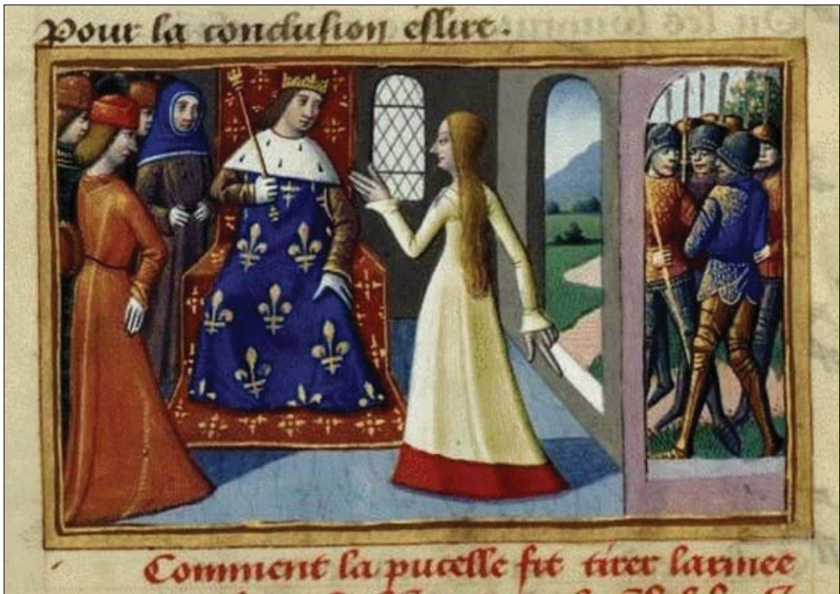
Figure 3. Miniature from Vigiles du roi Charles VII . Joan of Arc and Charles VII, king of France.

him, and to test her “powers” as a prophetess, but it was to no avail, because she bowed before him, and said, “God give you a happy life, sweet King!” 1