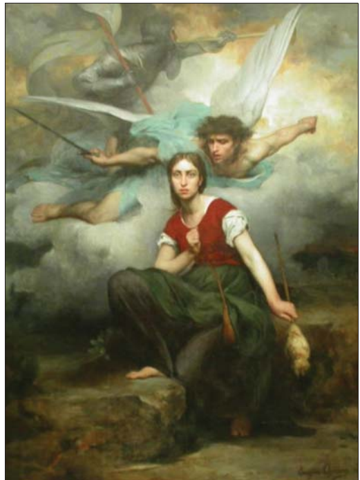
Figure 1. Jeanne d'Arc , by Eugène Thirion (1876). The portrait depicts Joan of Arc's awe upon receiving a vision from the Archangel Michael.

Joan's fame came when she claimed to hear the voice of God, which instructed her to expel the English and to have the Dauphin, Charles Valois (Crown Prince of France) crowned king of France. Incredibly, Joan would get her chance to meet with the Dauphin Charles VII when the situation changed for the worse in 1429. In 1429, the city of Orléans, loyal to the French crown, had been under siege by the English for over a year. With