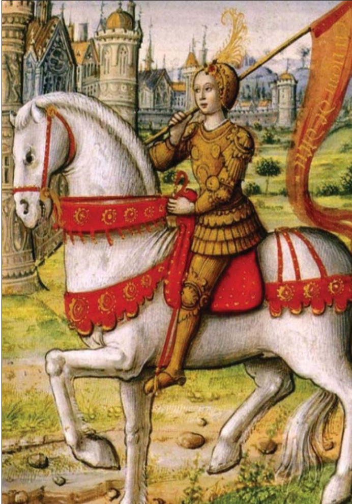
Figure 4. Joan of Arc depicted on horseback, illustration from a 1505 manuscript.

One can definitely suspect that the king of England and the English Regent of France did not take it to be cordial.