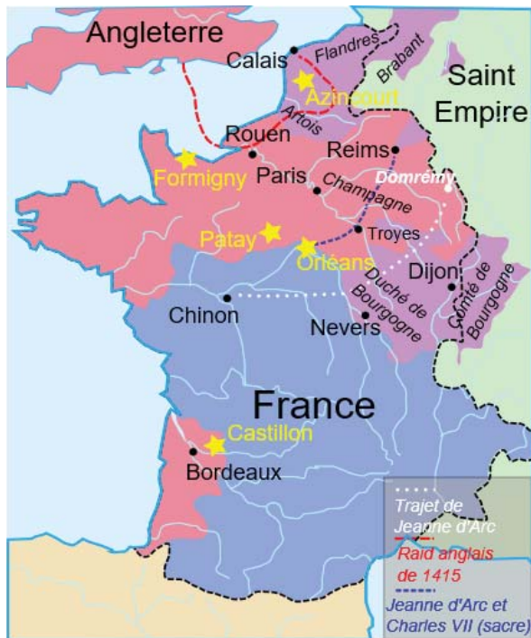
Figure 7. France in the Hundred Years' War

Sir William Glasdale and his small English force, seeing that they could