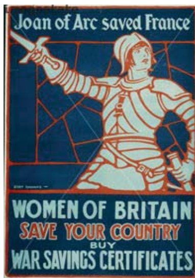
Figure 4. Joan of Arc , World War I British propaganda.

Perhaps nowhere is Joan of Arc more continually re-imagined than in popular culture. It is safe to say that Joan of Arc is a cultural phenomenon, a person