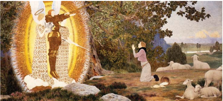
Figure 2. The Vision and the Inspiration , oil and gold leaf on canvas by Louis Maurice Boutet de Monvel, c. 1907-1909, National Gallery of Art.