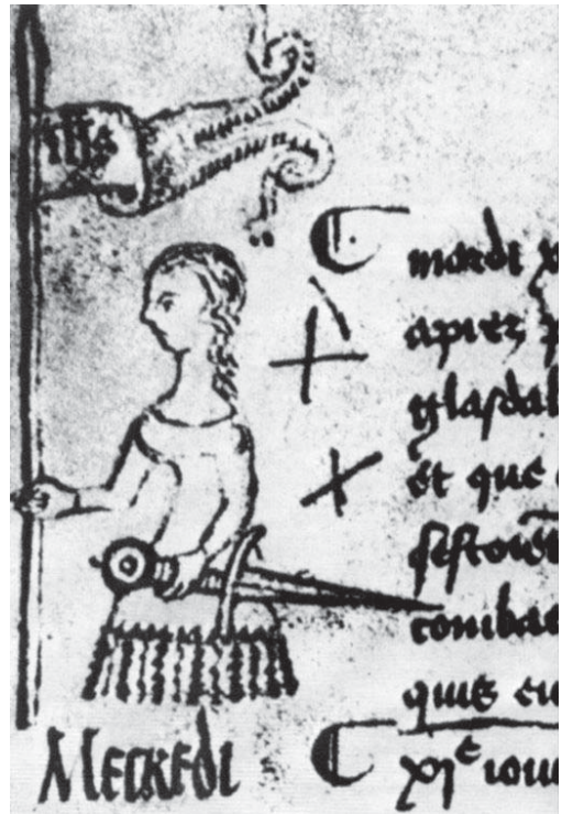
Figure 1. Joan of Arc , sketch by Clément de Fauquembergue, 1429.

the Farnsworth Art Museum, distinguished