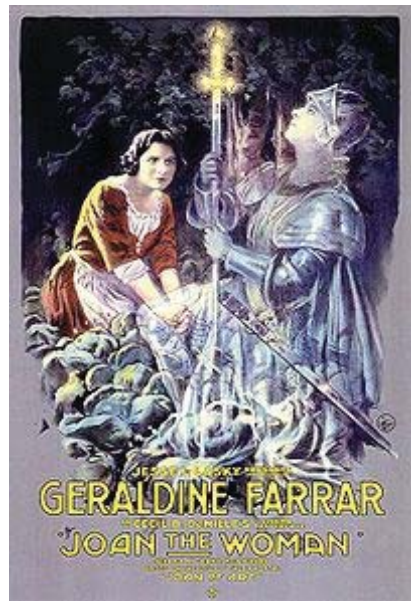
Figure 3. Poster for Joan the Woman by Cecil B. DeMille, starring Geraldine Farrar. 1916.

To modern audiences, raised on films where emotion is conveyed by dialogue and action more than by