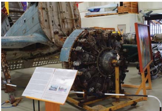
Figure 6. SBD-2p BuNo. 2137.