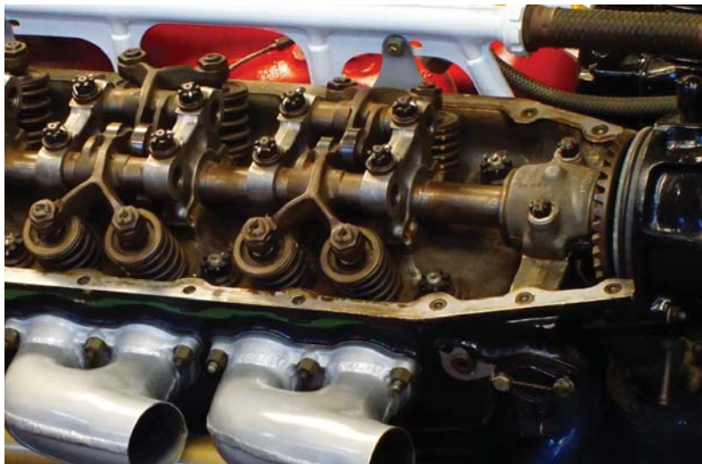
Figure 2. This image shows a section of the Allison V-1710 valve train. The Allison used a single overhead cam with four valves per cylinder. Ford Motor Company was the prime supplier of the R-2800 and they produced the engine in Dearborn, Michigan. Additionally, Continental Motors Corporation built the Merlin under license from Rolls Royce in Muskegon, Michigan.

The East Campus is within walking distance of the Main Campus. The East Campus includes an impressive display of engines. They include the Allison V-1710 that powered such aircraft as the P-40 Warhawk, the Pratt & Whitney R-2800 that powered the Corsair, and the famous Rolls Royce Merlin that powered, amongst others, the Supermarine Spitfire and the P-51 Mustang. The most notable feature of this display is that the engines are not behind glass. That is, the visitor