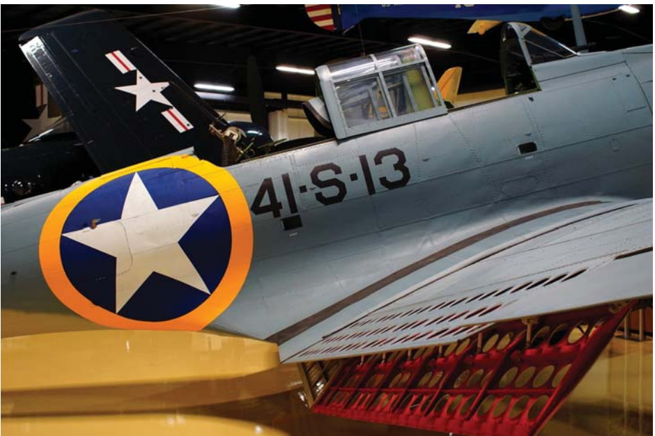
Figure 4. SBD-3 Dauntless BuNo. 00624. Note the perforated braking flaps. These slowed the plane's dive and provided the pilot with increased maneuverability.

The SBD-3 Dauntless BuNo. 00624 on display at the Main Campus of the Air Zoo rested on the bottom of Lake Michigan for fifty years. Once recovered, restoration technicians, staff, and volunteers at the Air Zoo spent nine years bringing the plane to show condition. Flying from the USS Ranger , BuNo. 00624 took part in Operation Torch, the invasion of North Africa in 1942. Lieutenant John "Jacko" DeVane Jr., awarded the Navy Cross, logged most of BuNo. 00624's flight time. 5