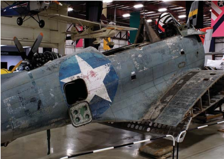
Figure 5. SBD-2p BuNo. 2137. Visitors can stand shoulder to shoulder with the restoration technicians at the Air Zoo.

The second Dauntless on display at the Air Zoo, SBD-2p 2173, is still undergoing restoration. Though its history is unclear, BuNo 2173 was likely present at the Battle of Coral Sea aboard the USS Yorktown. In 1944, perhaps due to carburetor icing, BuNo. 2173's engine cut out during a training run. The pilot, Lieutenant John Lendo, ditched the plane in Lake Michigan. A and T Recovery pulled the plane from 250 feet of water in 2009. 6