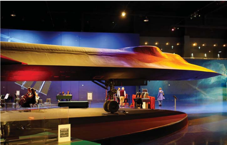
Figure 1: SR-71 Blackbird.

The Air Zoo is an aviation museum located in Portage, Michigan on the southwest side of the Lower Peninsula. The museum features two campuses, the Main Campus and the East Campus. In all, the Air Zoo has fifty aircraft on display. In the main exhibit hall, one can view perennial favorites such as the SR-71 Blackbird, B-25 Mitchell, P-47 Thunderbolt, and F-14 Tomcat. The lighting in the main exhibit hall is somewhat low but better and more interesting than the lighting at the National Museum of the USAF in Dayton, Ohio. Thus, it is wise to bring along a camera tripod and museum officials do not object to this. The Air Zoo placed colored lights in strategic positions to give interesting color effects to the aircraft on display. For example, when viewed from the right hand side, the SR-71 takes on an interesting gold hue.