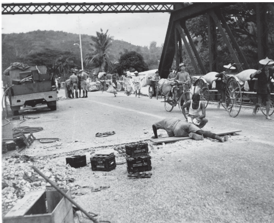
Figure 1. Royal Engineers preparing to blow up a bridge near Kuala Lumpur during retreat.

By 11 December 1941, the RAF had suffered the loss of up to half the aircraft in the northern airfields. Air Vice-Marshal Pulford pulled his squadrons