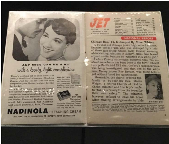
Figure 2. Author’s photo of Jet Magazine featuring article on Emmett Till’s lynching. Taken from the entrance to the Emmett Till memorial exhibit. National Museum of African American History and Culture. March 16, 2016.

There are images of African Americans being lynched. The most horrific ones include white citizens posing with the mangled and mutilated bodies hanging from trees or bridges by ropes, looking proud of their accomplishments. This floor also houses artifacts from possibly the greatest catalyst to the civil rights movement, the lynching of 14-year-old Emmett Till. With permission from his family, his original casket is on display. Per the family’s instructions, taking pictures here is forbidden. A museum worker at the entrance explains this to