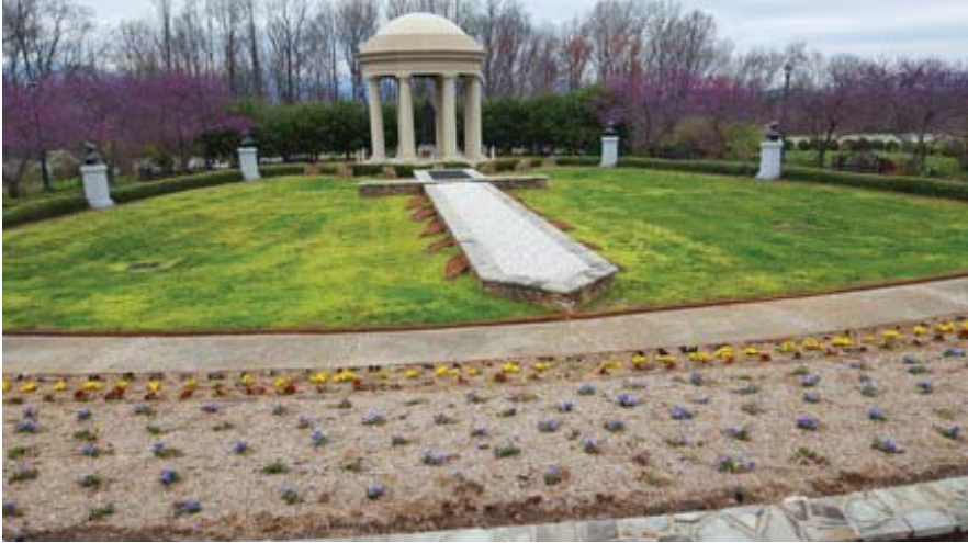
Figure 2. The English Garden, photo by author.

The Memorial offers guided tours which generally start every half hour. Though visitors may also walk the site themselves, the tour is highly