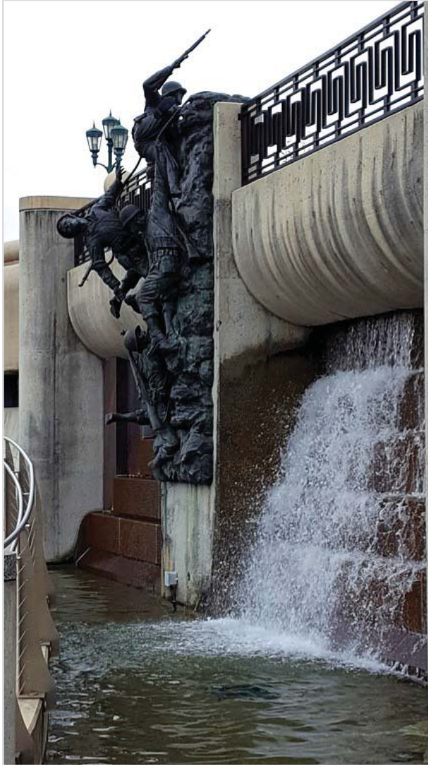
Figure 4. Scaling the Wall , photo by author.

In the center, between the defensive works, is possibly the most inspiring of the many works of art in the Memorial. Nineteen feet tall and inspired by the scaling of the cliff at Pointe du Hoc by elements of the US 2nd Ranger Battalion,