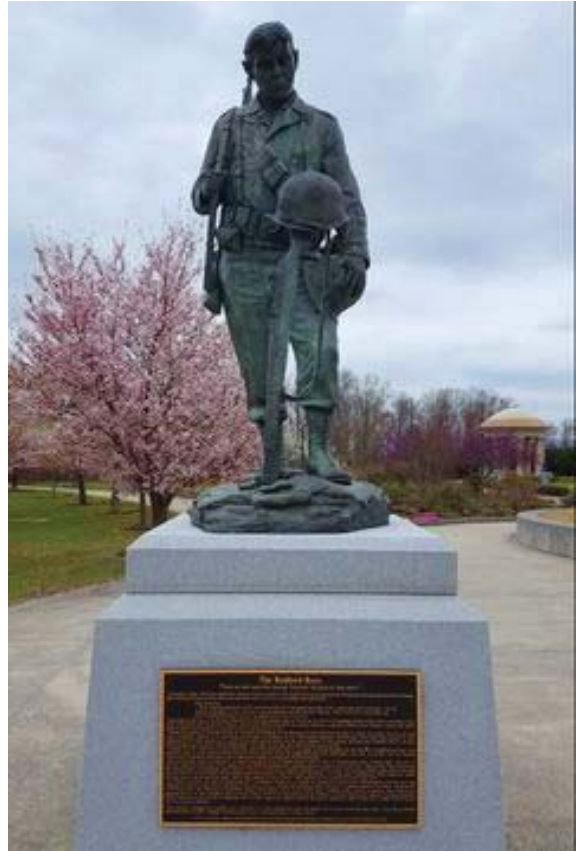
Figure 1. The Bedford Boys, photo by author.

Winston Churchill adorn the western and eastern boundaries respectively. Canada is included as part of the British Commonwealth. In addition, the eastern rim originally featured a bust of Josef Stalin. This, in recognition of the Soviet