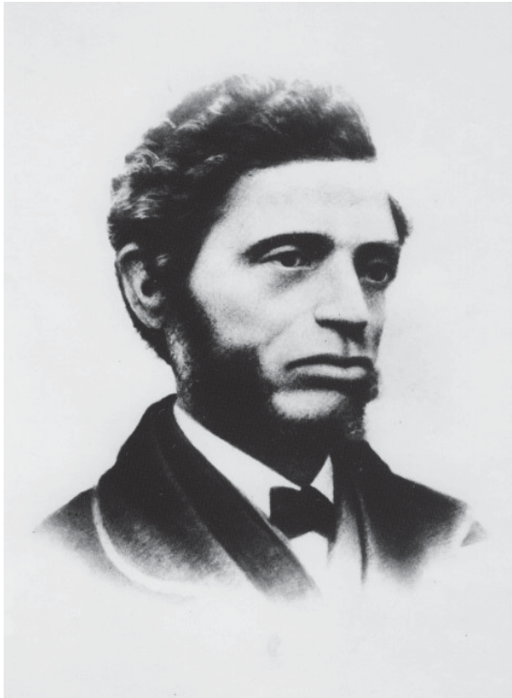
Figure 3. William Cooper Nell (1816-1874), photographer unknown.

The somewhat unlikely figure at the center of this struggle was William Cooper Nell, who as a boy attended one of these segregated schools, Boston's Belknap Street School for Negroes, where he was scarred by a humiliation that